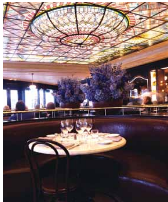
CLOCKWISE FROM LEFT TO RIGHT: St Lawrence Market carries all kinds of local produce; the EdgeWalk experience at the iconic CN Tower takes nerves of steel; the spectacular stained-glass ceiling at La Socièté.

"GYM. I MUST GYM," I THINK IN THE MORNING, STARTING with a healthy bowl of berries at the Shangri-La's signature restaurant, Bosk, before hitting the treadmill. Laps of the hotel's chic swimming pool complete my workout and I sink into a cabana for respite, donning a plush robe.