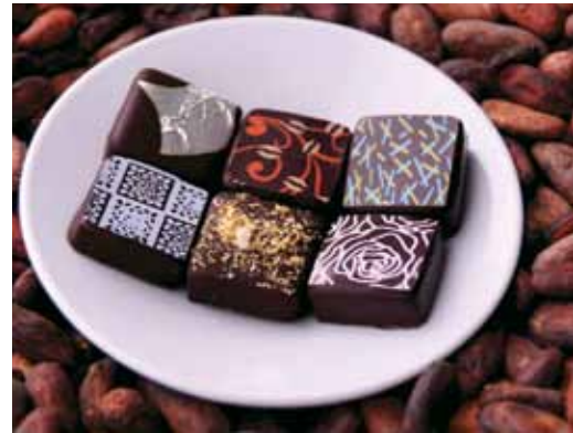
"THE RIGHT WAY TO SAMPLE CHOCOLATE IS BY PUTTING A PIECE IN YOUR MOUTH AND LETTING IT MELT BETWEEN YOUR TONGUE AND THE ROOF OF YOUR MOUTH," EXPLAINS IAN WYLLIE HANDING ME A SQUARE OF DEEP-BROWN GOODNESS