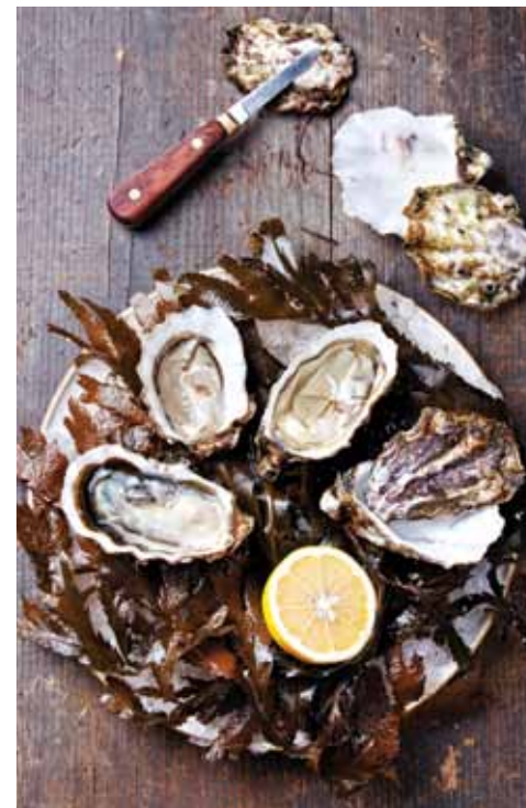
THIS PAGE, CLOCKWISE FROM TOP LEFT: Cronuts are a delicious combination of donut and croissant; a kimchi dog from Kitchen Cargo makes an appearance on the Secret Menu and Side Streets tour by Foodies on Foot; Canada produces several varieties of oyster on both the east and west coasts.

Craving something savoury, I drop in to La Soci t , which marries a French bistro with Toronto's cosmopolitan ambience. Modelled after 1920s Parisian design with intricate mosaic-tiled floors and over-sized leather banquettes, the highlight is the stunning stained-glass ceiling – and the superb steamed